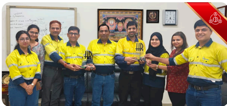
PEOPLE FIRST HR EXCELLENCE AWARD