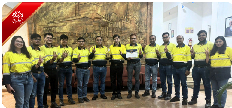
COMMUNITY-DRIVEN SUSTAINABILITY IMPACT AWARD BY CII