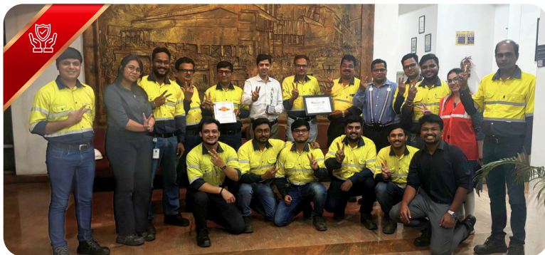
CII SAFETY, HEALTH, AND ENVIRONMENT EXCELLENCE AWARD