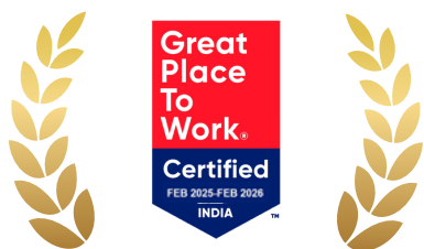
Great Place to Work